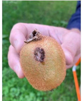
Example of fruit scarred by Sclerotinia