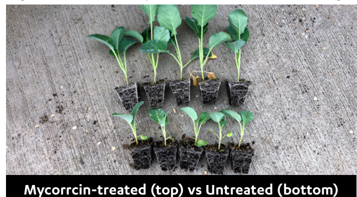
Figure 2. Broccoli seedling system