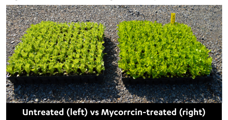
Figure 2. Lettuce seedlings at 42 days