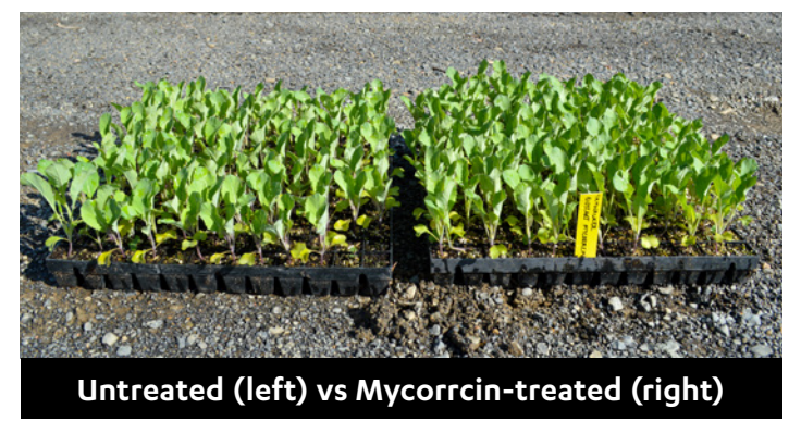
Figure 4. Cauliflower seedlings at 36 days

These early benefits are the results of better nutrition and the predictors for earlier harvesting times and bigger yields.