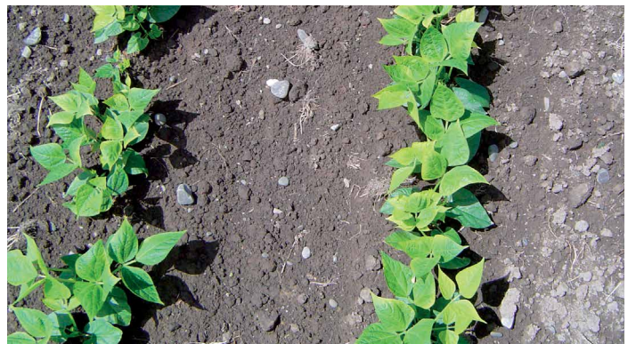
Post emergence herbicide + spray oil

The application of agrochemicals is a necessary part of crop production. However the application of these chemicals can check the growth of plants, often at critical stages in their development.