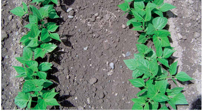
Foliacin 500 mL/ha + post emergence herbicide + spray oil

Here Foliacin has been added at the rate of 500 mL/ha with an application of post-emergence herbicide and spray oil. The Foliacin treated plants have not been checked and maintained a healthy leaf.